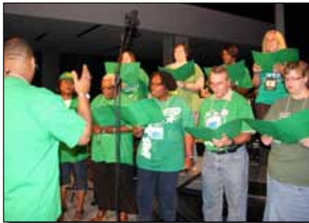
The OCSEA Solidarity Choir started off Convention with a version of "Solidarity Forever."

Solidarity was the theme of the first full day of Convention. Labor music and photos of SB 5 activism filled the hall, and delegates, led by the OCSEA Solidarity Choir , sang "Solidarity Forever," setting the mood for the days and weeks ahead.