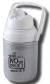
42 oz. Thermos!