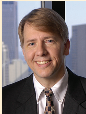
STATE TREASURER RICHARD CORDRAY

“Could your family use an extra $4,536* this year?”