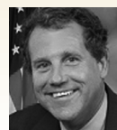
SHERROD BROWN OHIO CONGRESSMAN