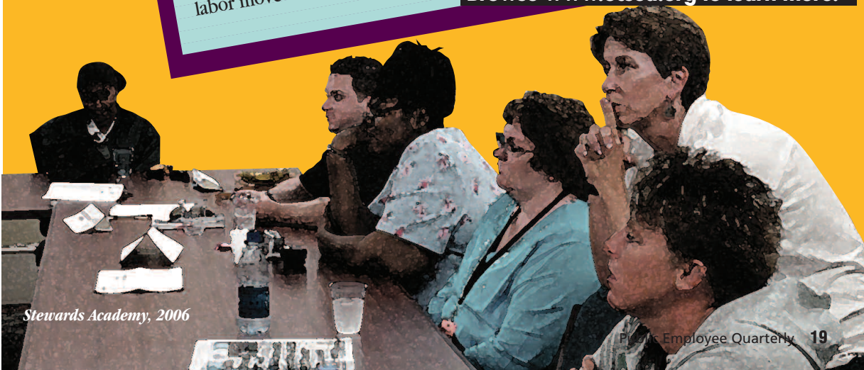
Stewards Academy, 2006

Follow up by writing to the credit bureaus. Report the suspected identity theft and ask them to confirm in writing that they have no file on your child. Sample letters are available at www.ohio.gov/IDprotect