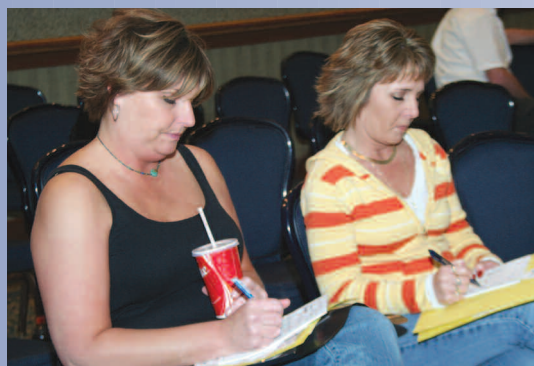
Members attended an array of workshops, including OCSEA's "Grey's Anatomy," focusing on the inner workings of the state budget.