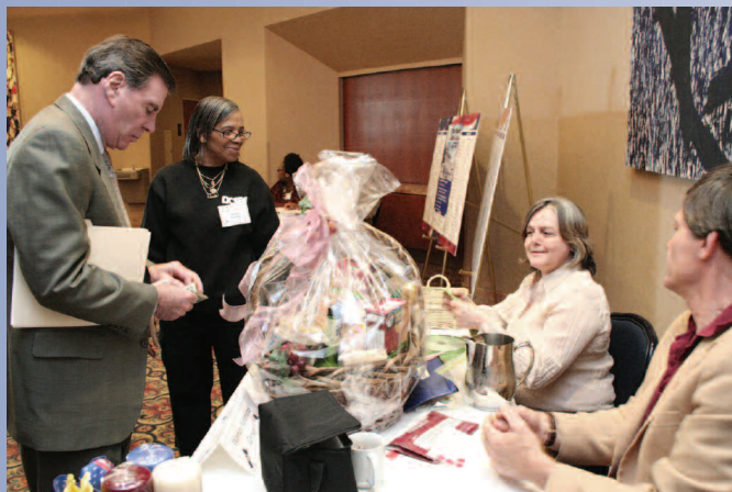
Special guest AFSCME president Gerald McEntee takes a break from picture taking to make a donation to the OCSEA Women's Action Committee.